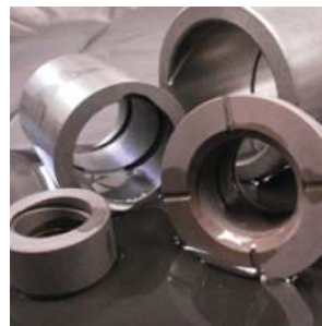
Self Lubricating Bearings and Thrust Washers