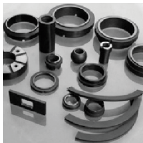
Custom Bearing and Wear Components