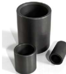
High Performance Peek and Polyimide Bearings